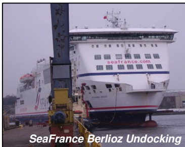
SeaFrance Berlioz Undocking

After the successful refit of sister vessel SeaFrance Berlioz in March 2009, SeaFrance are due to dock passenger RO-RO SeaFrance Nord Pas De Calais at the beginning of August for her annual docking and refit.