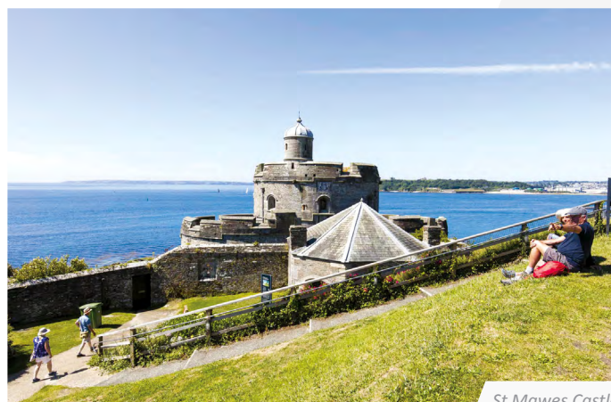
St Mawes Castle

All cruise passengers will be welcomed to Falmouth by the Falmouth Cruise Ambassadors.