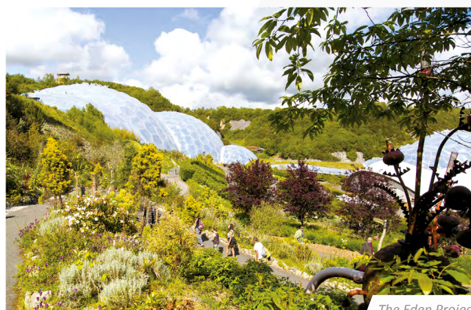
The Eden Project