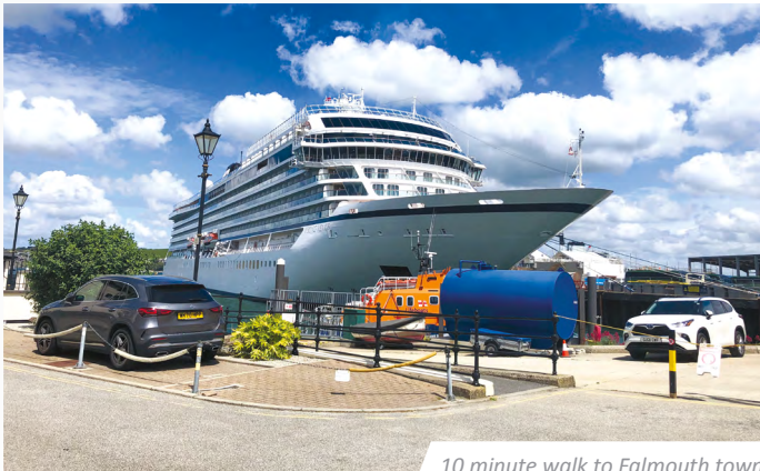
10 minute walk to Falmouth town