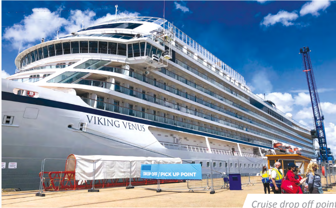
Cruise drop off point