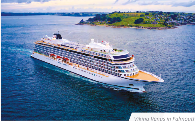
Viking Venus in Falmouth