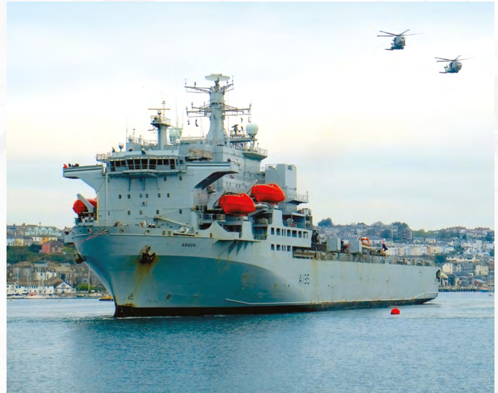
| RFA Argus returns to A&P Falmouth

Together we have maintained the highest level of vessel availability and increased real efficiencies in Fleet Time. Our low cost, collaborative approach has resulted in a 98% on time delivery record to the MoD.