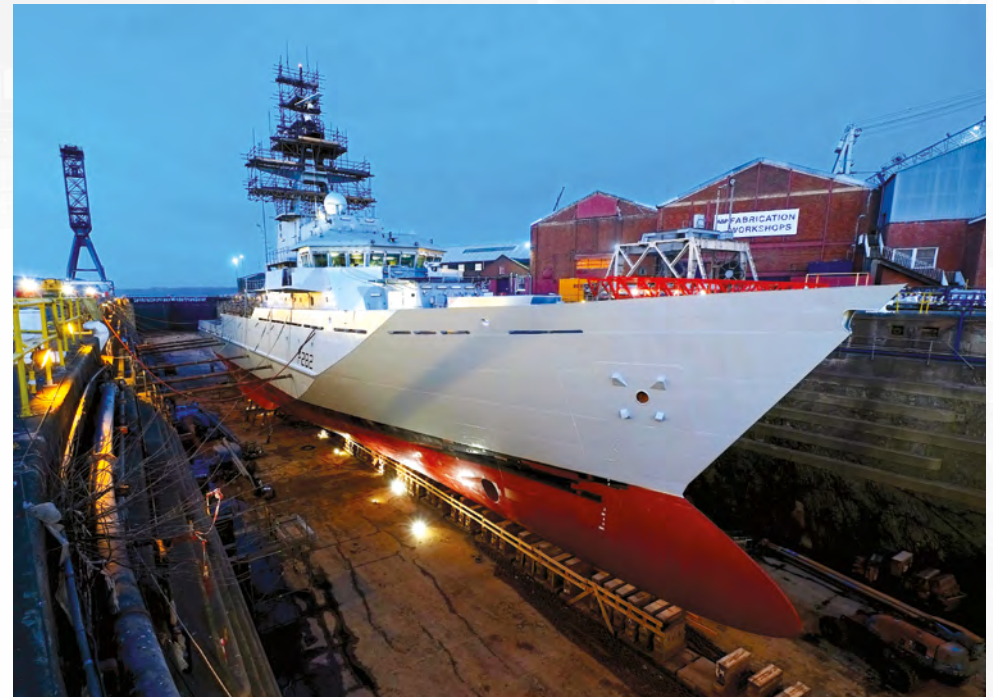
| HMS Severn in dock at A&P Falmouth

The A&P team worked closely with subcontractors and managed the programme on behalf of the MoD.