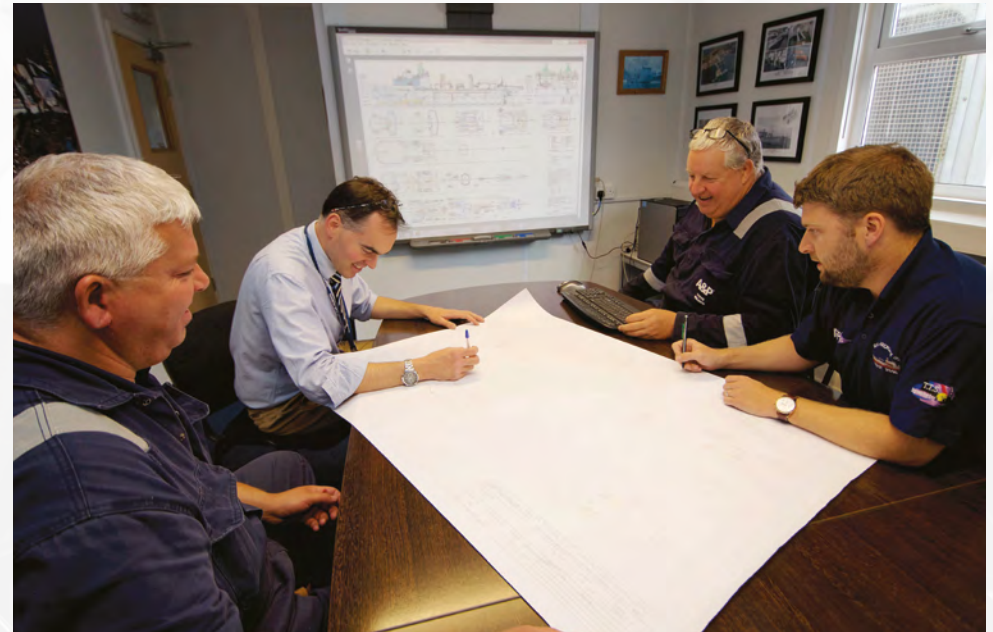
Collaboration is key to the success of A&P's 12 year partnership with Commercially Supported Shipping

Over the last 12 years A&P has managed and installed over 1,000 Alteration and Additions packages to UK MoD ships. The calibre of A&P's work can be demonstrated by the low number of warranty claims. A&P has a history of 98% on time delivery for MoD vessels.