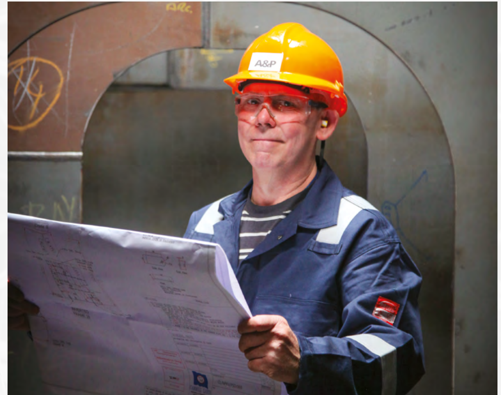
A&P Group Defence providing fabrication services to BAE Systems

This facility has been used to fabricate large sections of the Queen Elizabeth Class Carriers whilst simultaneously fabricating stern sections for the ASTUTE Class, with capacity to spare, and so can handle multiple fabrication tasks at the same time.