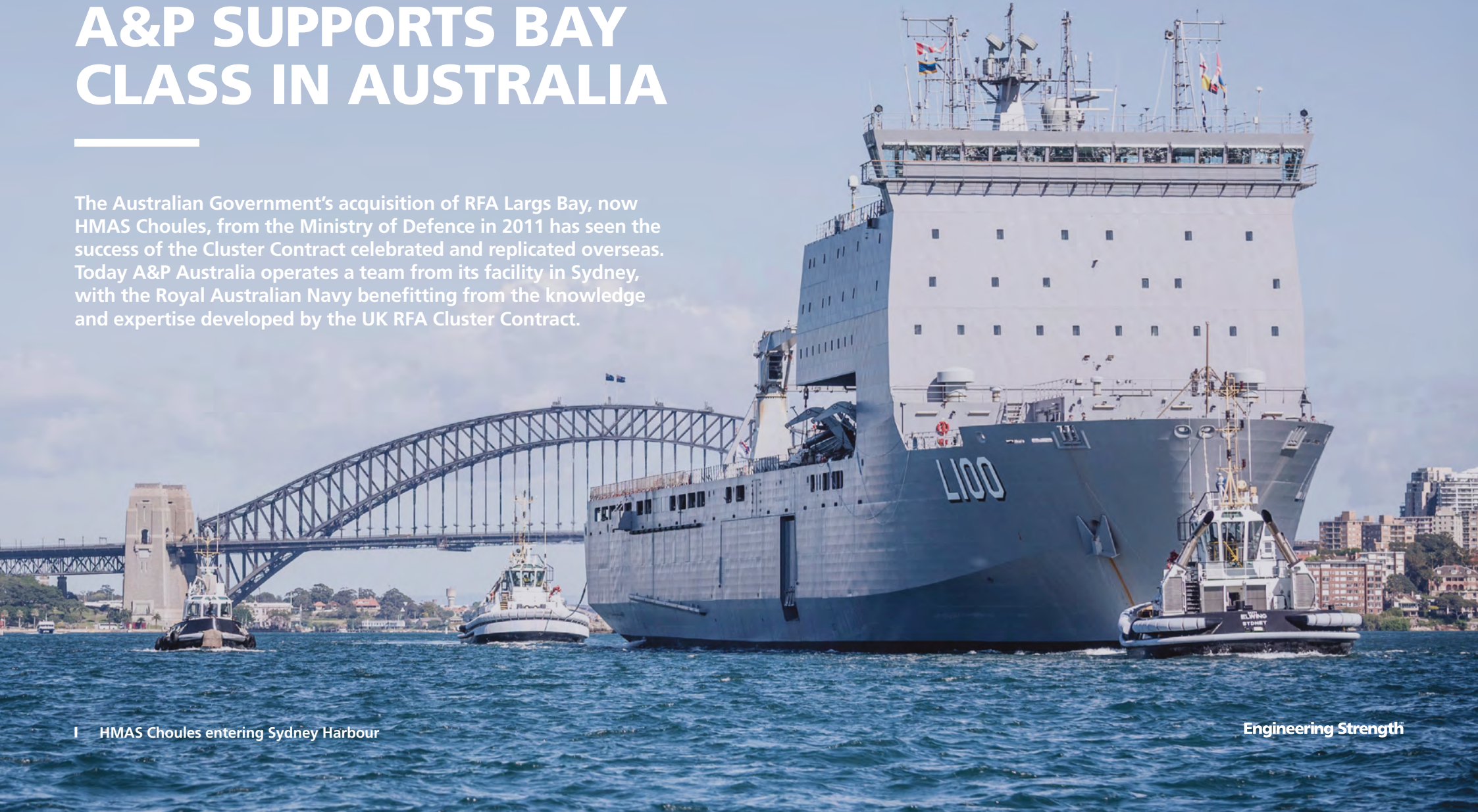
I HMAS Choules entering Sydney Harbour

The Australian Government's acquisition of RFA Largs Bay, now HMAS Choules, from the Ministry of Defence in 2011 has seen the success of the Cluster Contract celebrated and replicated overseas. Today A&P Australia operates a team from its facility in Sydney, with the Royal Australian Navy benefitting from the knowledge and expertise developed by the UK RFA Cluster Contract.