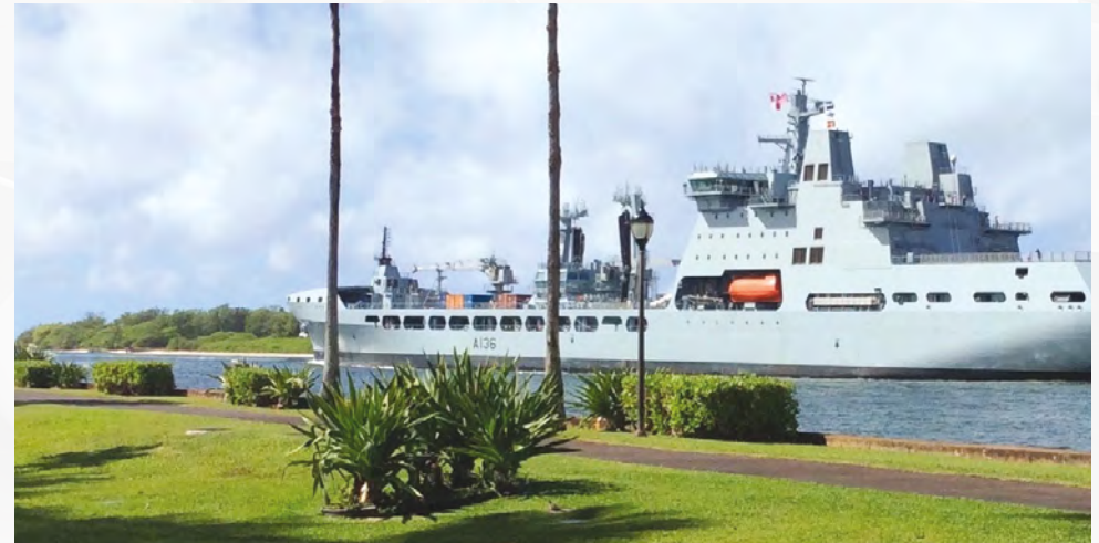
RFA Tidespring on her arrival voyage in Hawaii, supported by the Mars UKCCATS

A&P Group delivered the same support to Tiderace, Tidesurge and Tideforce.